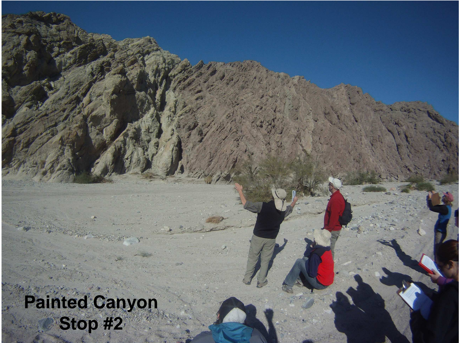
Painted Canyon Stop #2