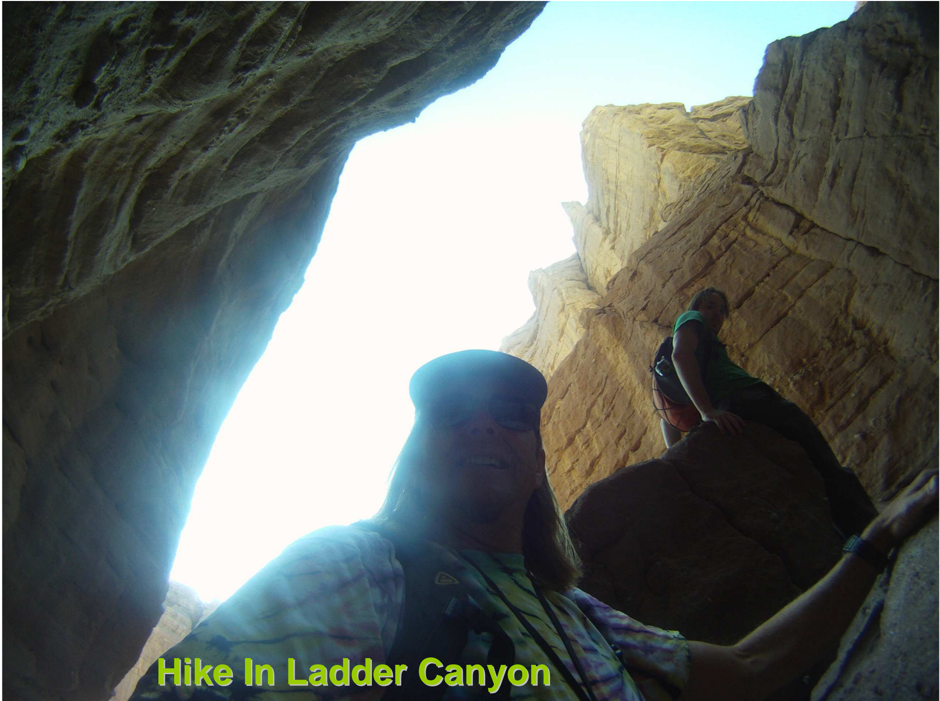
Hike In Ladder Canyon