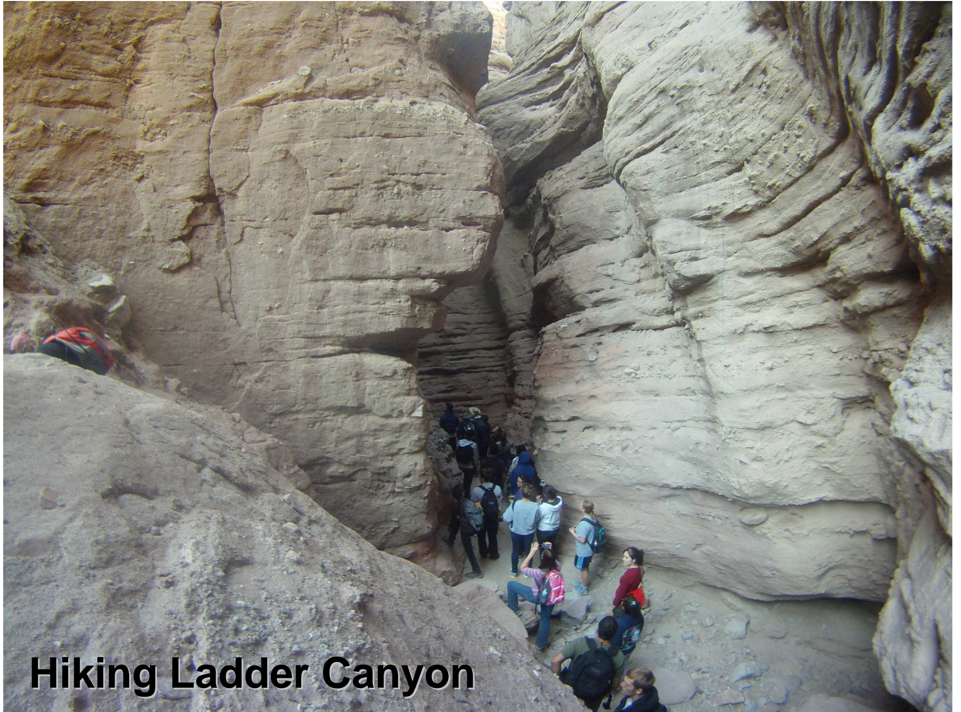
Hiking Ladder Canyon