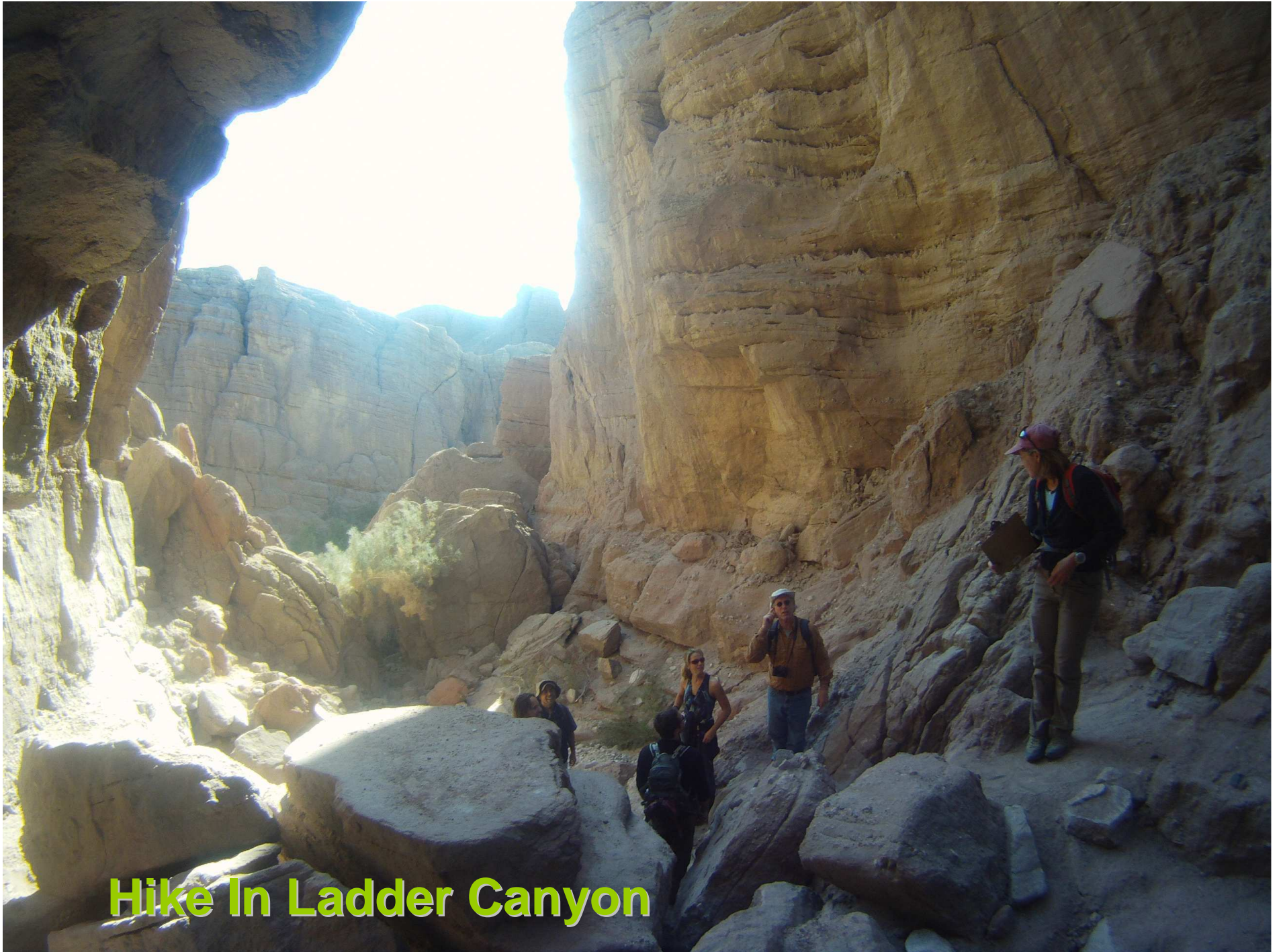
Hike In Ladder Canyon