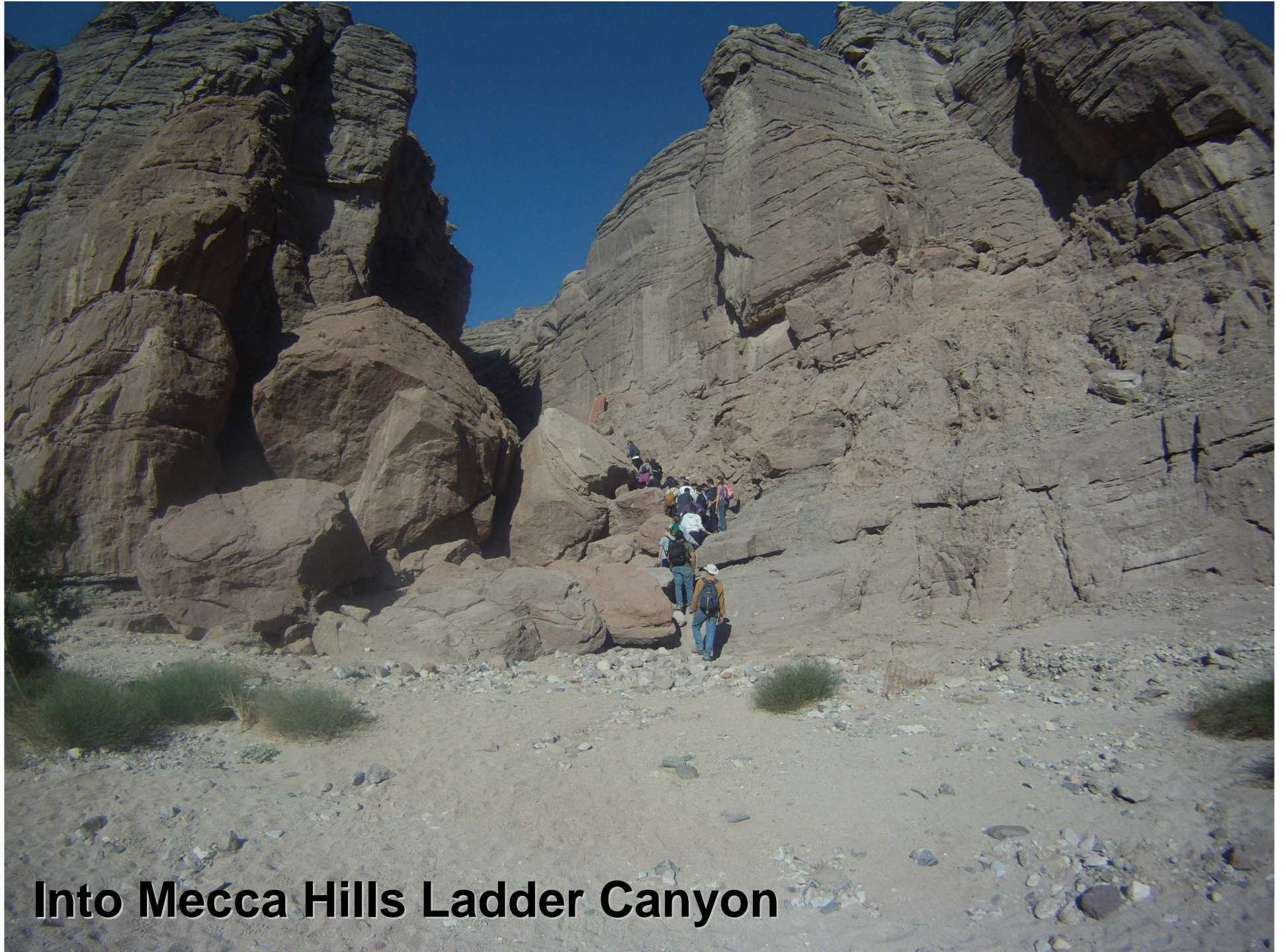
Into Mecca Hills Ladder Canyon