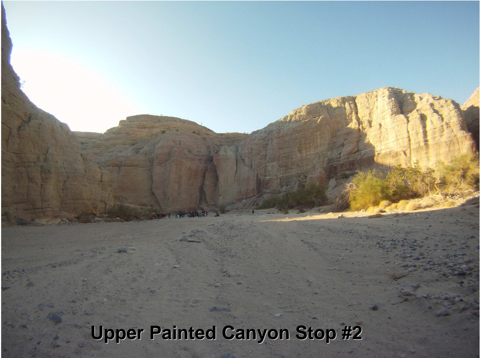
Upper Painted Canyon Stop #2