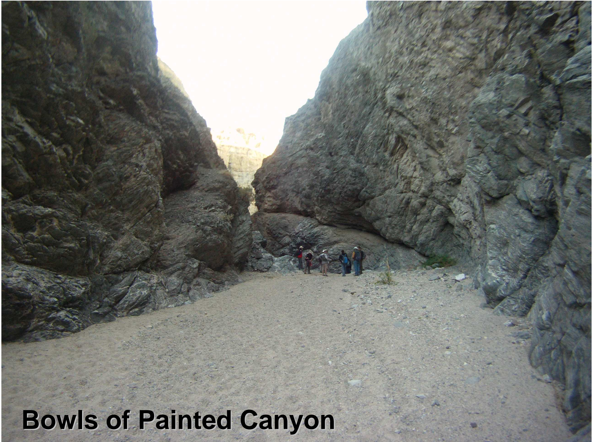
Bowls of Painted Canyon