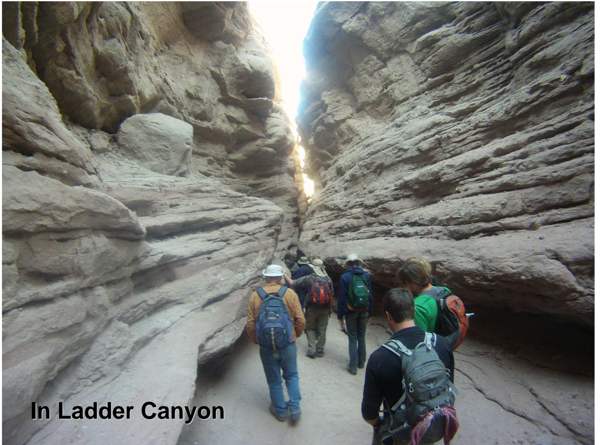
In Ladder Canyon