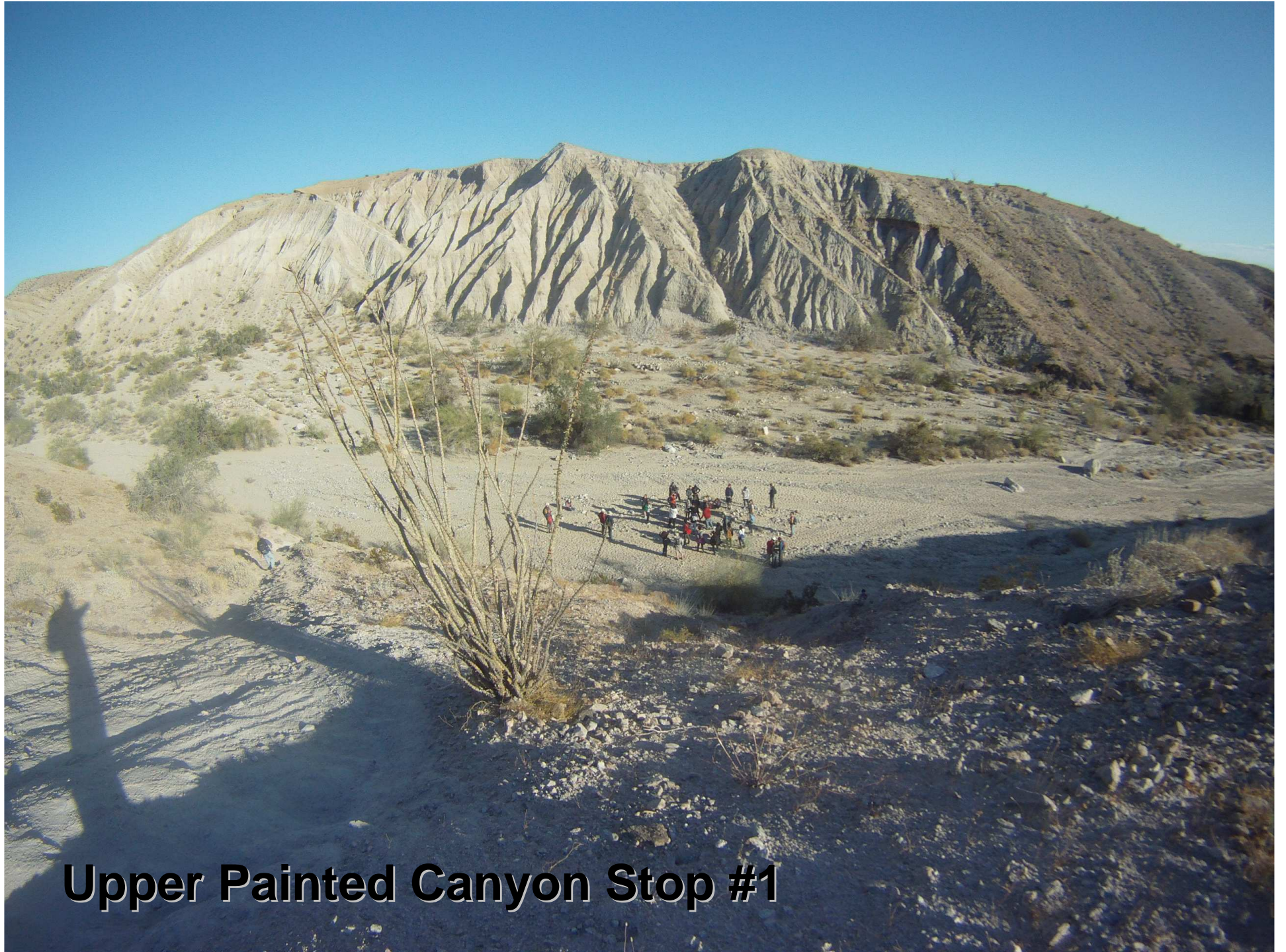
Upper Painted Canyon Stop #1